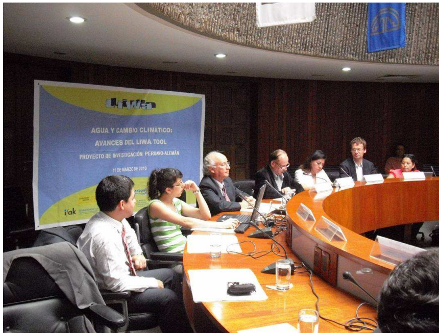
Figure 3: Stakeholder Seminar held at Comunidad Andina de Naciones on 11.03.2010

At present, implementation of the entire water system of Lima is nearing completion. By time of the conference presentation, the model of entire Lima will be presented. In parallel, preparations for Round Table discussions are at hand. Relevant stakeholders have been identified and integrated in the project by a series of stakeholder workshops, which also provided useful input to model development (Figure 3).